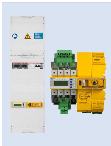
UMA710-2-...-ISO-BP (example illustration)